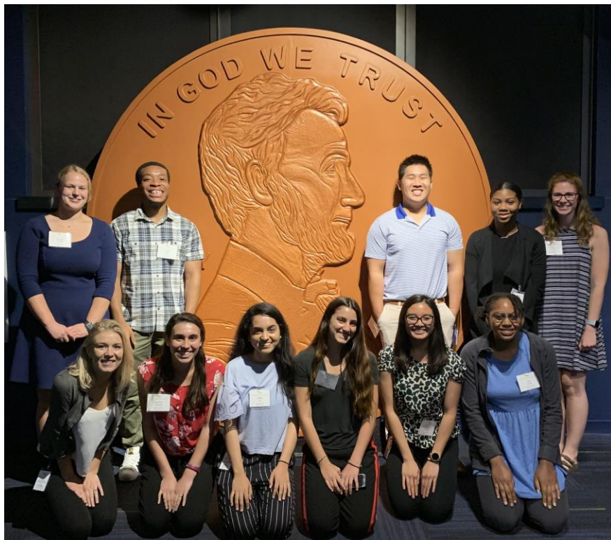
Students visited the Federal Reserve

On July 26, the Harvey A. Friedman Center for Aging's second annual eight-week Summer Research Experience concluded with a poster session where participating students presented their findings to an audience of their peers, faculty mentors, and other Washington University research staff.